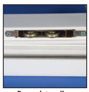
Brass plate rollers