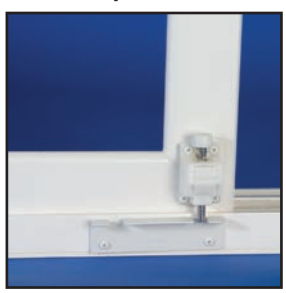
Security kick lock